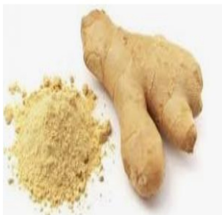
Figure 2: Zingiber rhizomes and powder