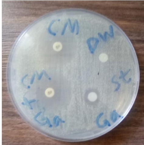
Figure 7: garlic crud extract (Ga), gentamicin (CM), distillate water (DW) and combination between garlic and gentamicin (CM+Ga) against S. aureus (st).

recorded in tables (1) ,(2) ,(3) and (4) separately