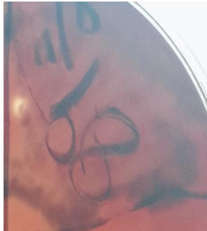
Figure 5: S. aureus on blood agar

hospital. All strains were cultured in Nutrient agar at 37°C for 24 hrs and then stored at 4 °C for further experiments.