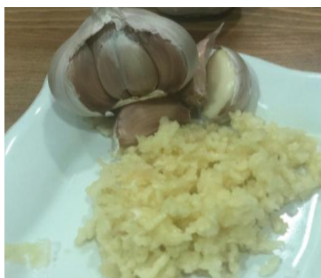
Figure 1: Garlic plant bulb and scrunch