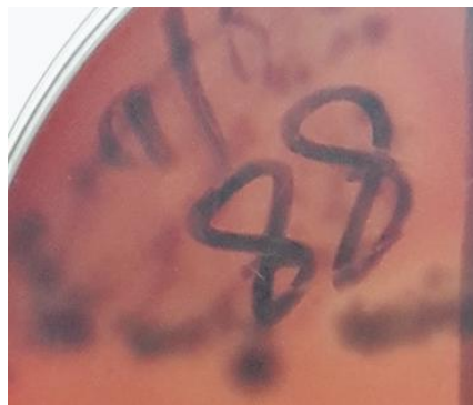
Figure 6: E. coli on blood agar