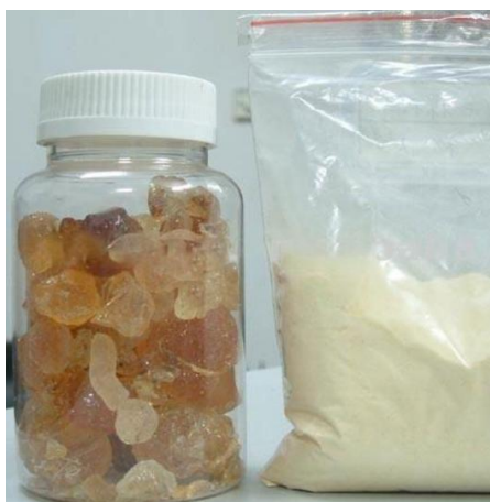
Figure 3: A. arabica L powder