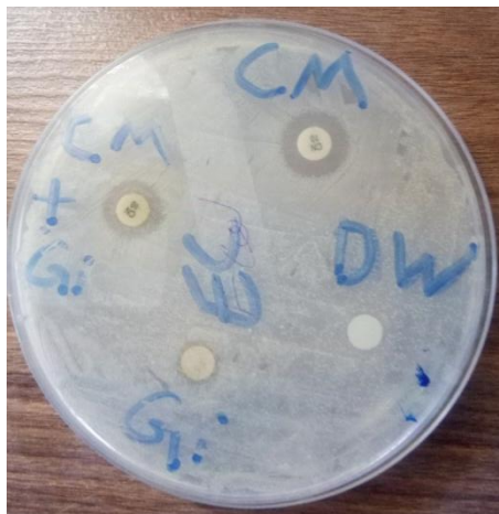
Figure 8: Ginger crud extract (Gi), Gentamicin (CM), distillate water (DW) and combination between Ginger and gentamicin (CM+Gi) against E. coli (EC).