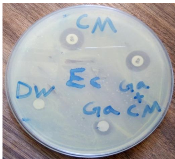
Figure 11: Garlic crud extract (Ga), gentamicin (CM), distillate water (DW) and combination between ginger and gentamicin (CM+Ga) against E. coli (EC).